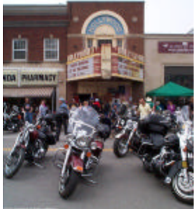
The Hollywood Theater is in need of major restoration. Let's Rally!

The Hollywood Theater stands as a catalyst to invoke inspiration towards the welfare of her community. A reflection of prosperous times intertwined with the hopes and dreams to rebuild an economy rooted in commerce and tourism.